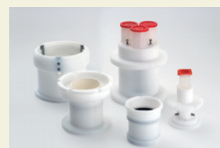
Wide range of adopters