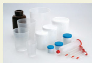
Wide range of containers

Ointment container, Disposal cup, Blow molding bottle, Stainless container, Paper container, Syringe, barrel, Glass bottle, Centrifuge tube, others.