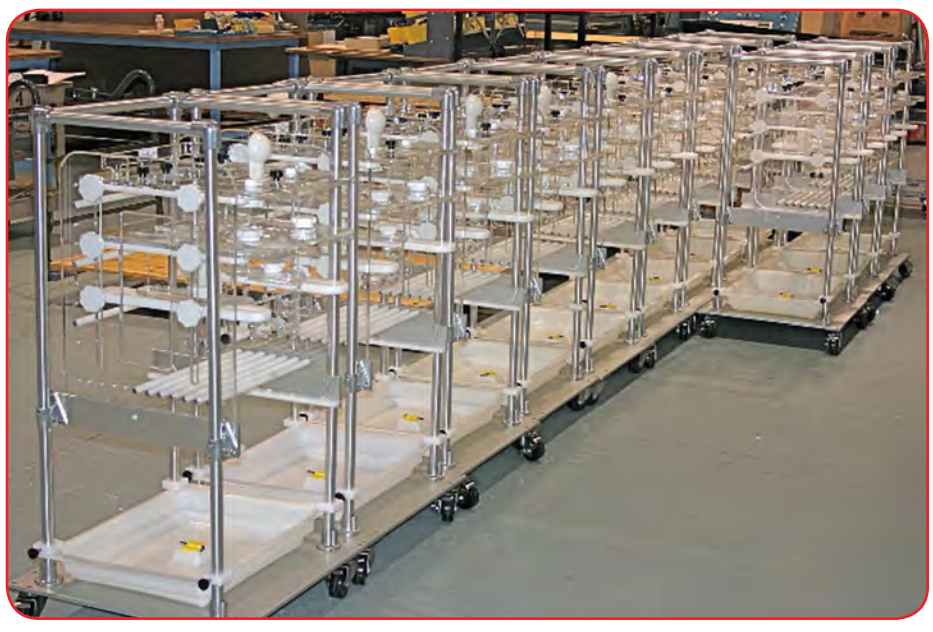
Primate chairs in typical production run.