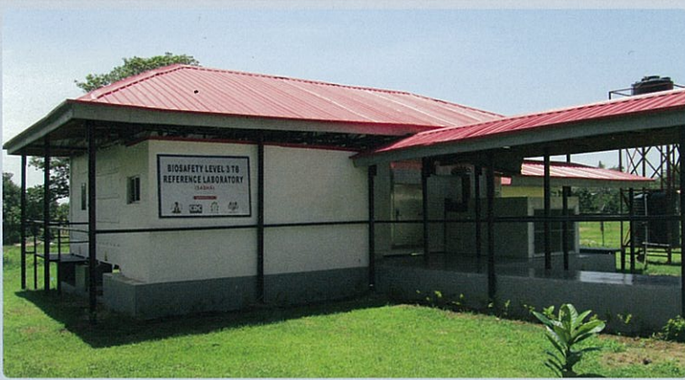
BSL-3 Laboratory in Zaria, Nigeria

Germfree integrates our time tested containment equipment, with self-contained HVAC systems, high containment filtration systems and casework into modular laboratories. We offer complete turnkey, one supplier, solutions to having your BSL-3 laboratory operational anywhere in the world.