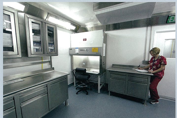
Washable and Decontaminable Surfaces