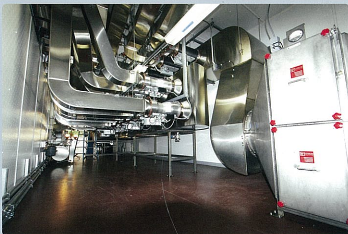
BSL-3 HVAC Mechanical Suite