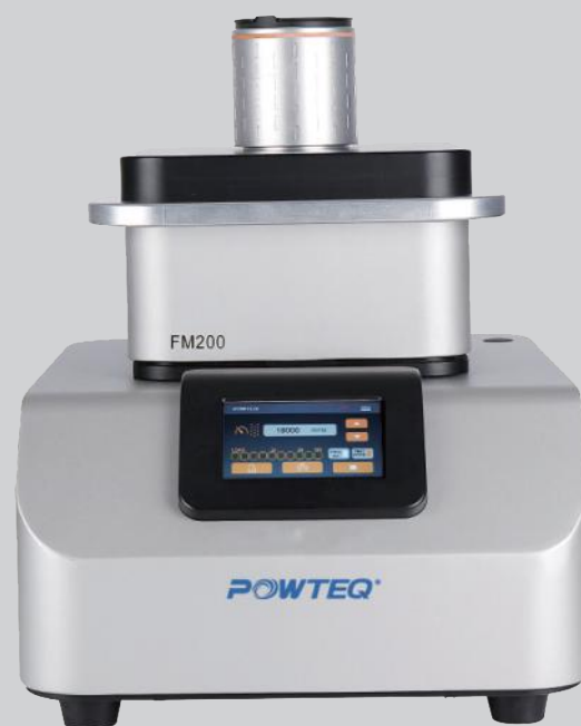
Ultra Centrifugal Mill FM200