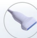
Linear probe 6.5-H10.0MHz: 7L4C 5.0-H11.0MHz: 8L4C 8.5-H14.5MHz: 10L25C