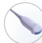
Micro convex probe 5.0-H9.0MHz: 6C15C 2.5-H6MHz: 3C20C