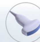
Convex probe 2.5-H6.0MHz: 3C6C