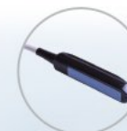
Intrarectal linear probe 4.5-H9.0MHz: 6I7C