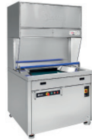
with shredder for vacuum system connection