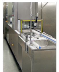
Easy integration with de-capping and re-capping modules