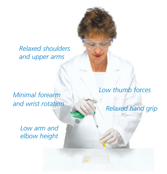
Ovation's "low profile" also allows better visibility for acquiring tips, and guiding tips into small vessels such as microtubes.

Ovation is a whole new class of pipette – not an old design with minor improvements. Its innovative shape naturally follows the contours of the palm, and allows all pipetting steps to be performed with neutral postures, minimal muscular movements, and low hand and arm elevations. Best of all, Ovation is the most comfortable, easy-to-use pipette you will ever experience!