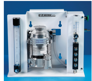
Vaporizer for the EZ7000 Classic System

A water-heated cage warmer or warming plate ( ATC1000 ) is used to retain the animal body temperature while in the induction chamber. After the initial anesthetizing, the animal can be moved to the heated surgical water bed and positioned in the nosecone.