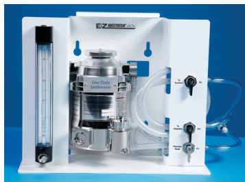
Vaporizer for EZB800 single animal system.

This is the system of choice for anesthetizing small animals. Animals to be anesthetized are placed into the acrylic induction chamber, and the system delivers a precisely blended mixture of oxygen and isoflurane.